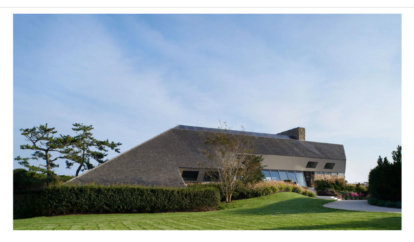
WEB-EXCLUSIVE HOME TOUR