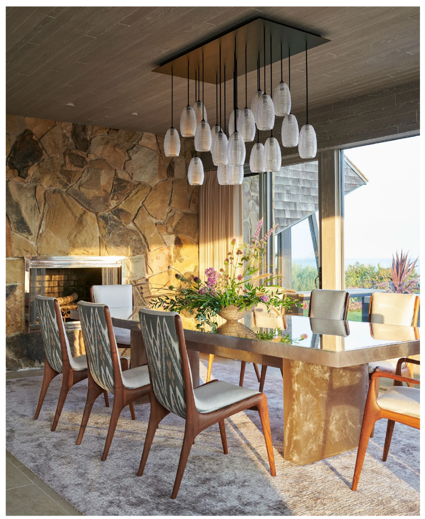
The colors of the sand and seashells on the beach, as well as the stones on the wall, informed the dining room's decor. Moon designed this cast-resin table with an inset glass top. "I wanted a table that would feel architectural, but not heavy," he says. "I settled on this amber resin with a smoky effect. It reminded me of the waves washing up on the beach." The <u>Vladimir Kagan</u> "sculpted sling" chairs were upholstered in an ivory acrylic yarn from <u>Link</u> and a handwoven ikat from <u>Bermingham & Co</u>.